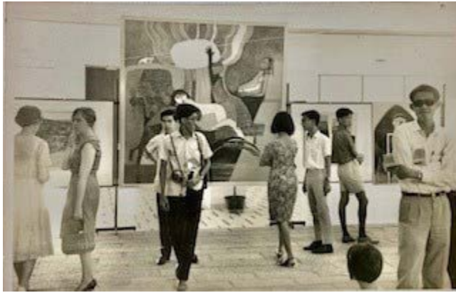
Children of the Sun in Khoo's exhibition at Singapore Conference Hall, 1966