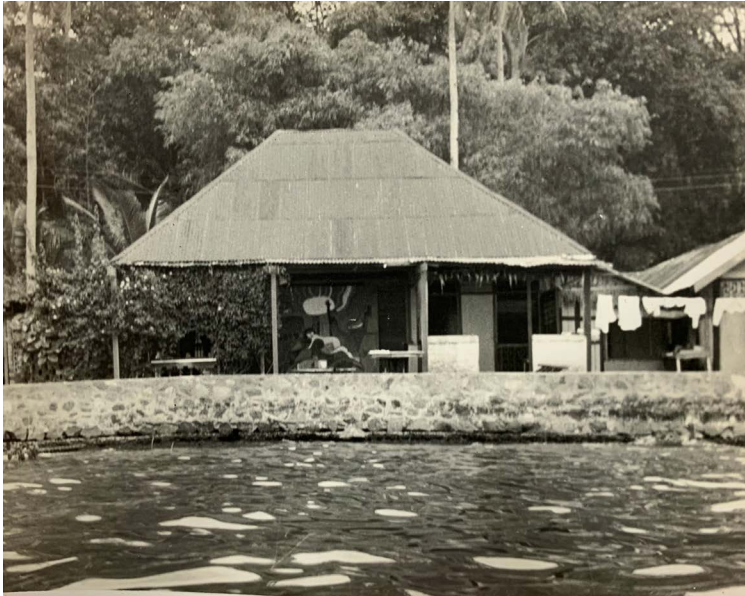
View of 291 Pasir Panjang Road from the sea, 1965