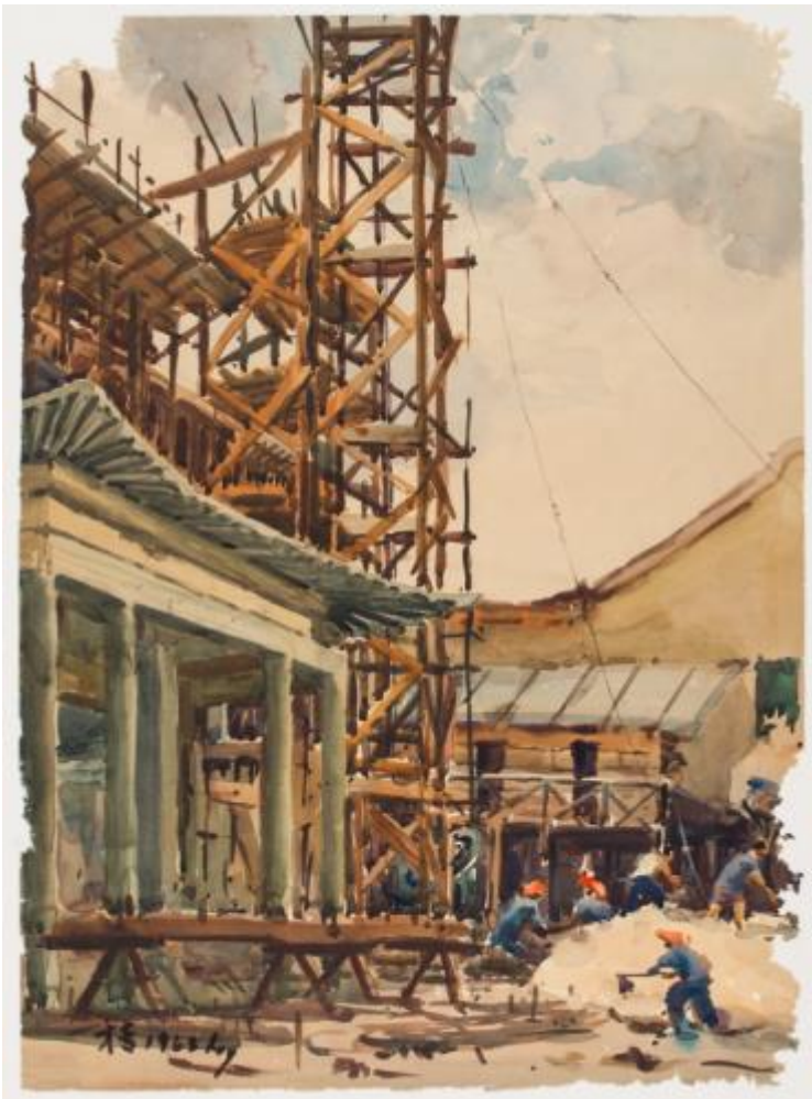
Loy Chye Chuan. Construction of Chinese Chamber of Commerce . 1963. Watercolour on paper, 50 x 37 cm. Collection of National Gallery Singapore.

Loy Chye Chuan captures the architecture of the Chinese Chamber of Commerce while it was under construction. The towering structure stands in stark contrast to the small figures of Samsui women labouring with their backs bent.