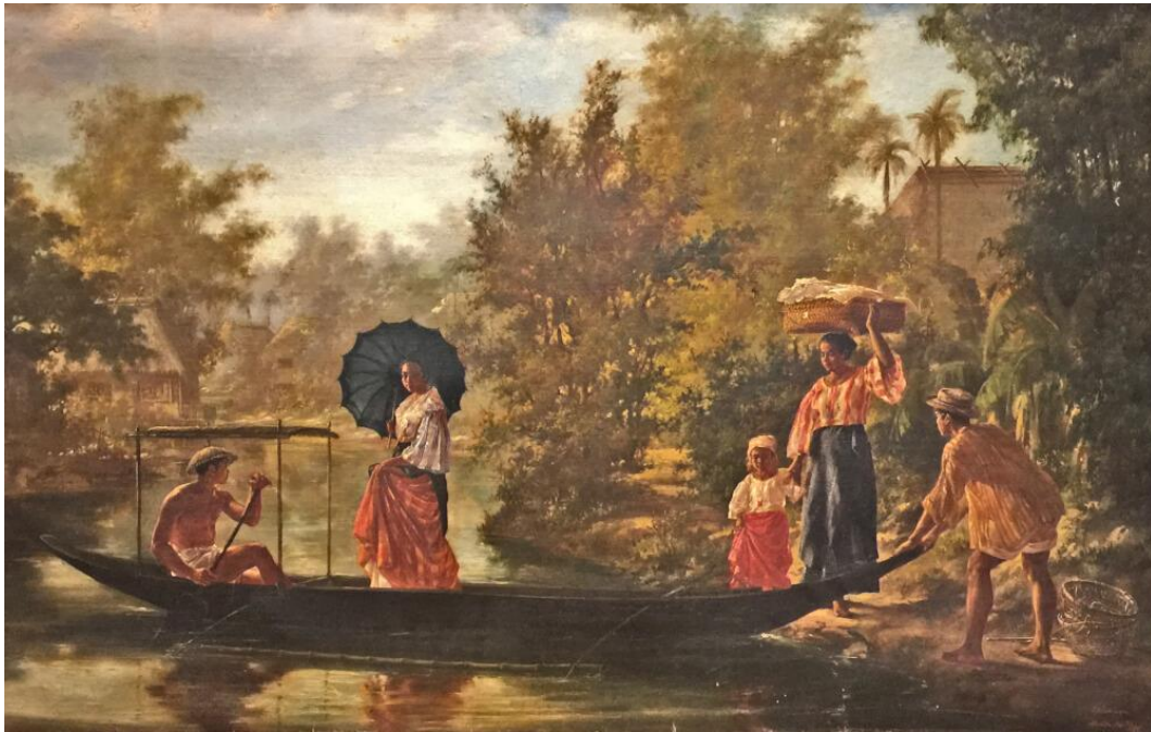
Félix Resurrección Hidalgo. La Banca . 1876. Oil on canvas, 64.1 x 101.1 cm. Private Collection.

Where do you think this lady and her child are going? Is it near or far away? Do they go there every day?