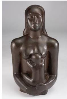
Sompot Upa-in (b. 1934, Thailand; d. 2014, Thailand) Mother 1961, bronze, 64 x 35 x 30 cm Collection of National Gallery Singapore