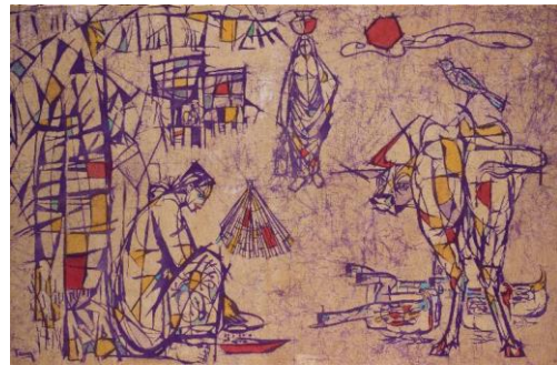
Chuah Thean Teng (蔡天定) (b. 1914, China; d. 2008, Malaysia) Morning c. 1960 – 1963, batik on cloth, 112 x 173 cm Collection of National Gallery Singapore