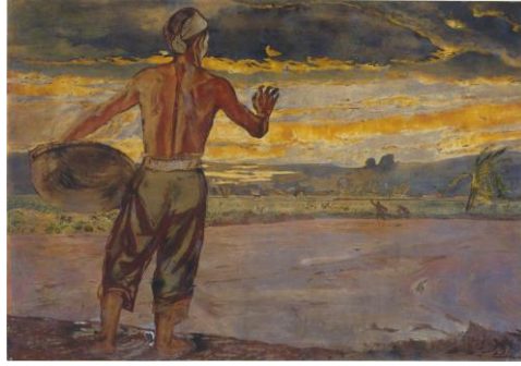
Nguyen Duc Nung (b. 1909, Vietnam; d. 1983, Vietnam) Binh minh tren nong trang (Dawn on a Farm) 1958, lacquer on board, 63 x 91.2 cm Collection of Vietnam Fine Arts Museum