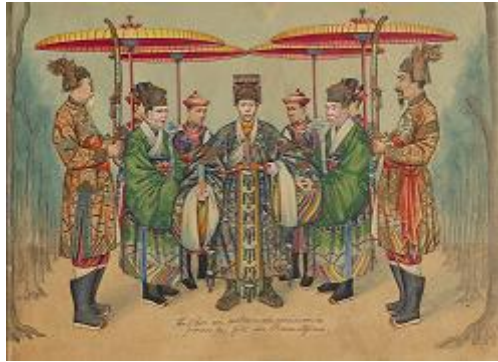
Nguyen Van Nhan (b. circa 1830s — 1840s; Vietnam, d. before 1919) Grande tenue de la Cour d'Annam (Official Dress of the Court of Annam), 1902, watercolour on paper, bound into linen-covered album, 23.6 x 31.8 cm Collection of National Gallery Singapore