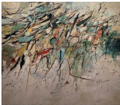
Jose Joya (b. 1931, Philippines; d. 1995, Philippines) Hills of Nikko , 1964, oil on canvas, 172 x 198 cm Collection of National Museum of the Philippines