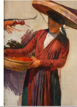
Victor Tardieu (b. 1870, France; d. 1937, Vietnam) La Tonkinoise au Panier (Tonkin Woman with a Basket) 1923 Oil on canvas 108 x 80 cm Collection of National Gallery Singapore