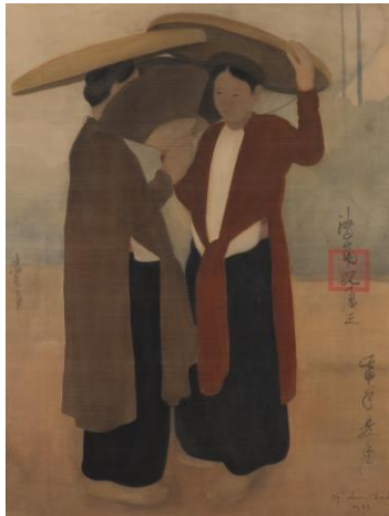
Nguyen Phan Chanh (b. 1892, Vietnam; d. 1984, Vietnam) The Singers in the Countryside 1932 Watercolour and ink on silk 65.4 x 49.4 cm Collection of National Gallery Singapore