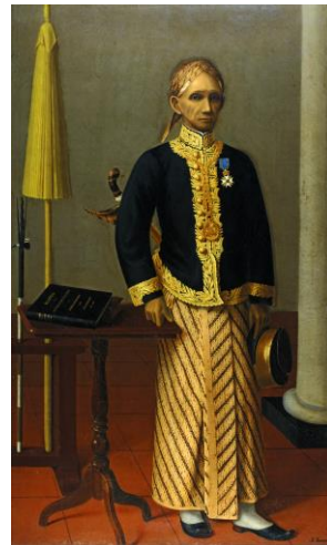
Raden Kusumadibrata (active c. 1872 – 1880s, Indonesia) Raden Adipati Kusumadiningrat, Regent of Galuh 1879, oil on canvas Collection of Nationaal Museum van Wereldculturen