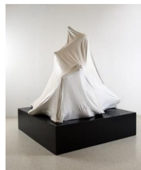
Edgar Talusan Fernandez (b. 1955, Philippines) Kinupot , 1977, moulded canvas over wood armature, 165 x 154 x 122 cm Gift of the artist, Collection of Ateneo Art Gallery