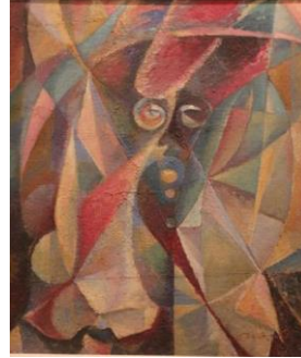
Fua Haribhitak (b. 1910, Thailand; d. 1993, Thailand) Face , c. 1956, oil on canvas, 55 x 65 cm Collection of National Gallery Singapore