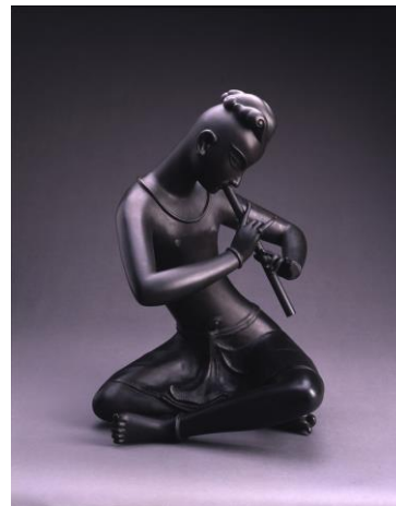
Khien Yimsiri (b. 1922, Thailand; d. 1977, Thailand) Musical Rhythm 1949 Bronze 53 x 39 x 36 cm Collection of Fukuoka Asian Art Museum