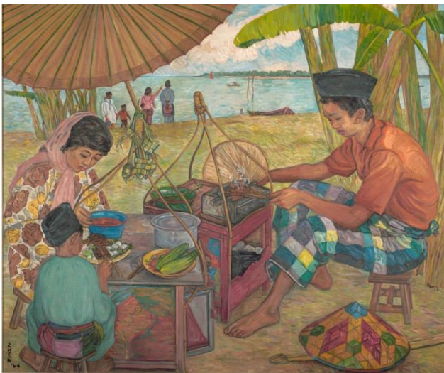
Georgette Chen Satay Boy 1964 Oil on Canvas 161 x 135 cm Collection of National Gallery Singapore.