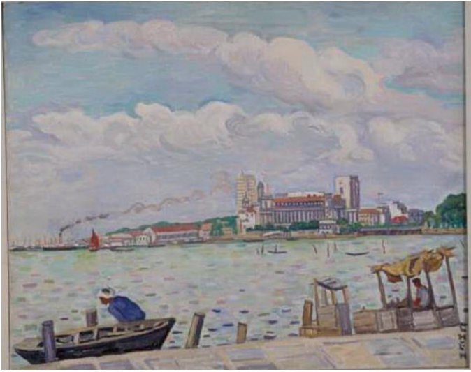
Georgette Chen Singapore Waterfront c. 1963 Oil on Canvas 50 x 61 cm Collection of National Gallery Singapore. Donated by the Lee Foundation.