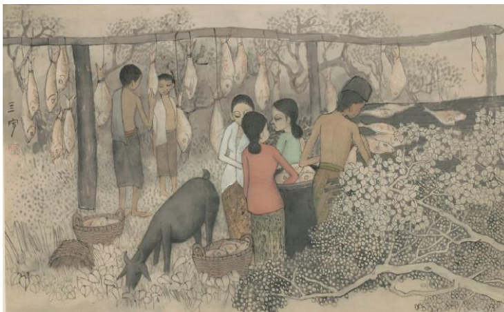
Cheong Soo Pieng Drying Salted Fish 1978 Chinese ink and colour on cloth 55.5 x 88.5 cm Collection of National Gallery Singapore. Gift of Trans Island Bus Services Ltd.