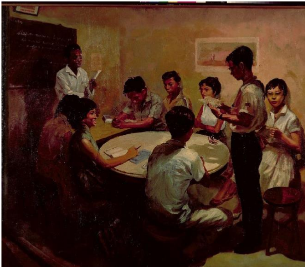
Chua Mia Tee National Language Class 1959 Oil On Canvas 112 x 153 cm Collection of National Gallery Singapore. Donated by Equator Art Society.