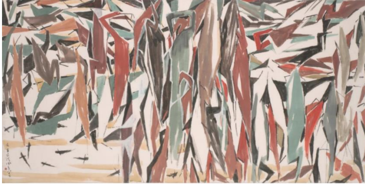
Chen Wen Hsi Hérons 1990 Chinese ink and colour on paper 123 x 245 cm Collection of National Gallery Singapore.