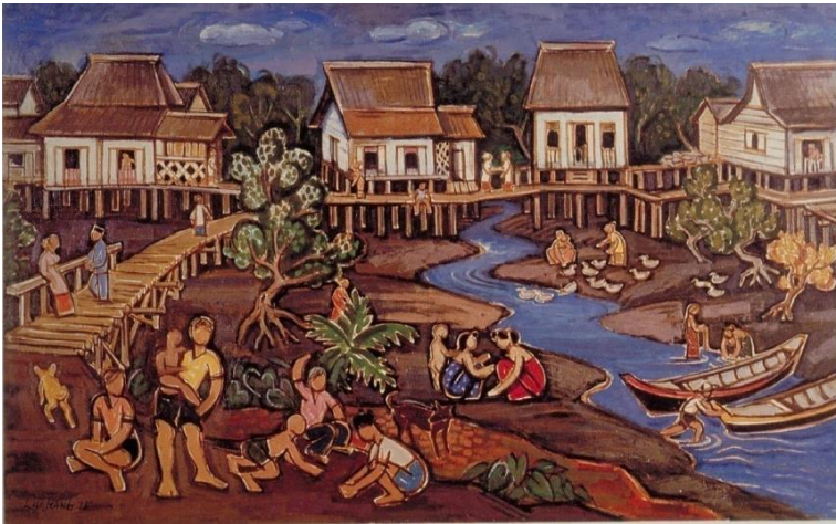
Liu Kang Life by the River 1975 Oil on canvas 126 x 203 cm Collection of National Gallery Singapore. Gift of Liu Kang.