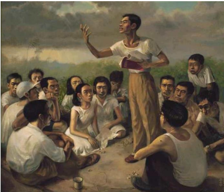
Chua Mia Tee Epic Poem of Malaya 1955 Oil on canvas 107.6 x 125.5 cm Collection of National Gallery Singapore.