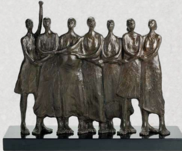
Dolorosa Sinaga. Solidarity . 2000/2025, open edition. Bronze, 78.5 x 96.5 x 20 cm; base 5.5 x 106 x 32.5 cm. Collection of National Gallery Singapore. © Dolorosa Sinaga.

What might small acts of resistance offer back to the world? These artists engaged with the urgent issues of their time, refusing to stay silent in the face of social, political or environmental injustice. Through their work, they imagined new possibilities for cultural and social change. From turning to craft and traditions to raise consciousness for local issues, to reimagining the meanings of housework and envisioning collective solidarity, their work emphasises women's often overlooked roles in political and social life and amplifies marginalised voices.