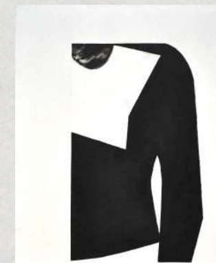
Nirmala Dutt. Woman I, II & III . 1999. Oil on canvas, 50 × 40 cm. Gift of T.K. Sabapathy. Collection of NUS Museum, National University of Singapore.