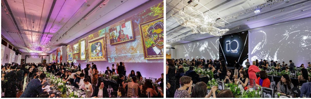
Gallery Gala guests in the Gallery's Singtel Special Exhibition Gallery 1