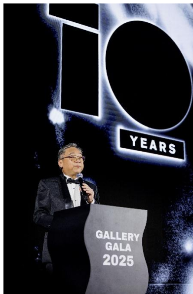
Deputy Prime Minister and Minister for Trade and Industry, Mr Gan Kim Yong, delivering his address at the Gallery Gala 2025

The milestone gala rallied support to advance the Gallery's mission in shaping a thoughtful and inclusive future in the arts