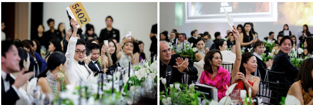
Gallery Gala guests bidding for lots during the Sotheby's-managed auction